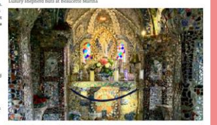
The Little Chapel