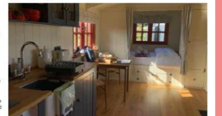
Luxury shepherd hut at Beauvieux Marina